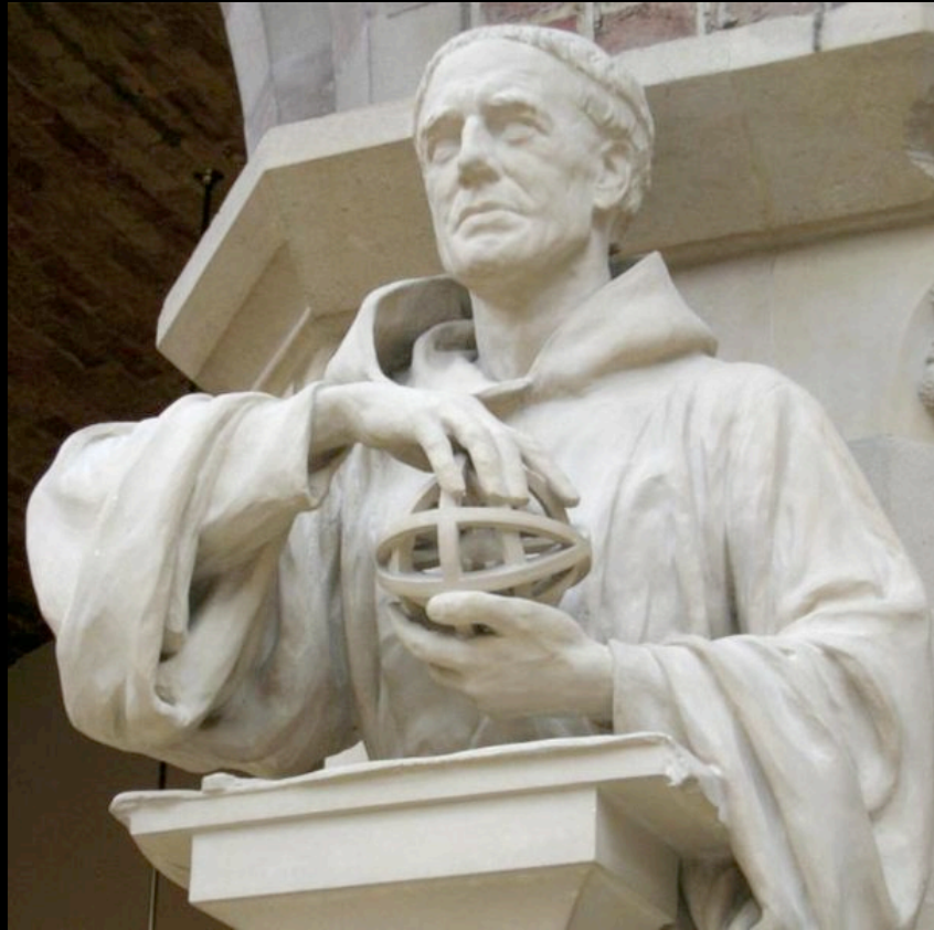
ROGER BACON (c. 1214-1294)