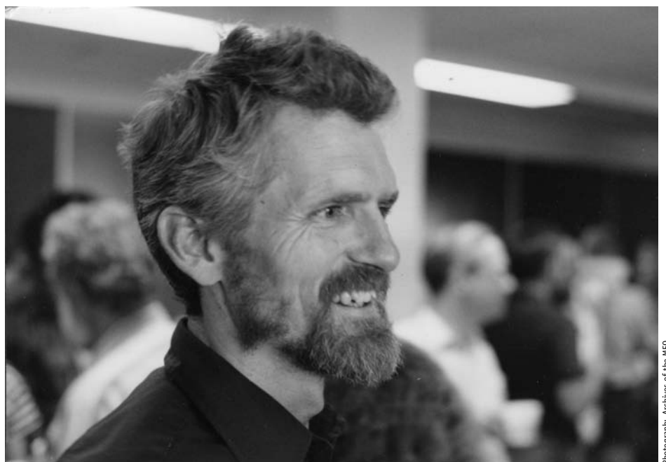
Hans Duistermaat in 1981

That fall a number of new insights were unveiled regarding continuous symmetry reduction in symplectic geometry through the work of Guillemin–Sternberg, Atiyah–Bott and Mumford. In these at first sight rather different contexts, namely quantum mechanics, quantum field theory and algebraic